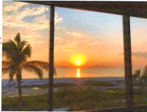
215 Gulf Front